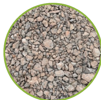
Recycled Concrete Bricks / Tiles (processed)