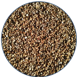
Gold Decorative Stone 7mm, 10mm, 20mm