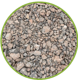
Recycled Concrete Bricks / Tiles (incoming)