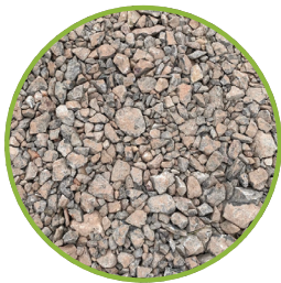
Recycled Concrete Bricks / Tiles (processed)