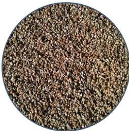
Honey Decorative Stone 7mm, 10mm, 20mm