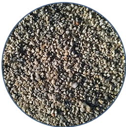
White Decorative Stone 7mm, 10mm, 20mm